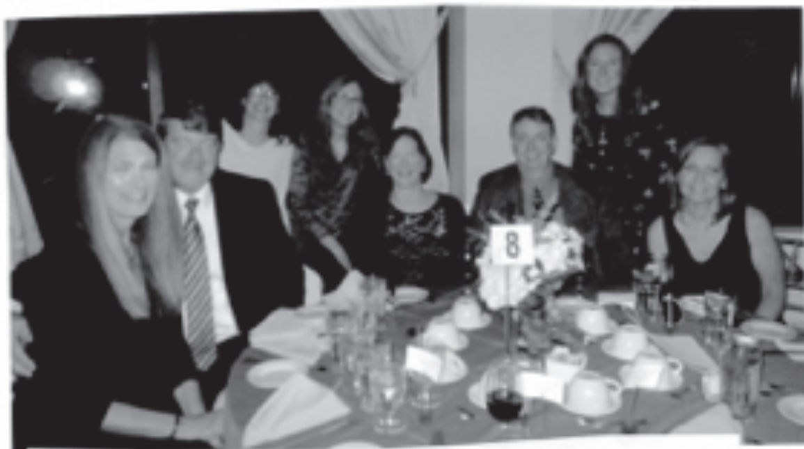
LITTLE ANGEL FUND'S 35 TH ANNIVERSARY DINNER