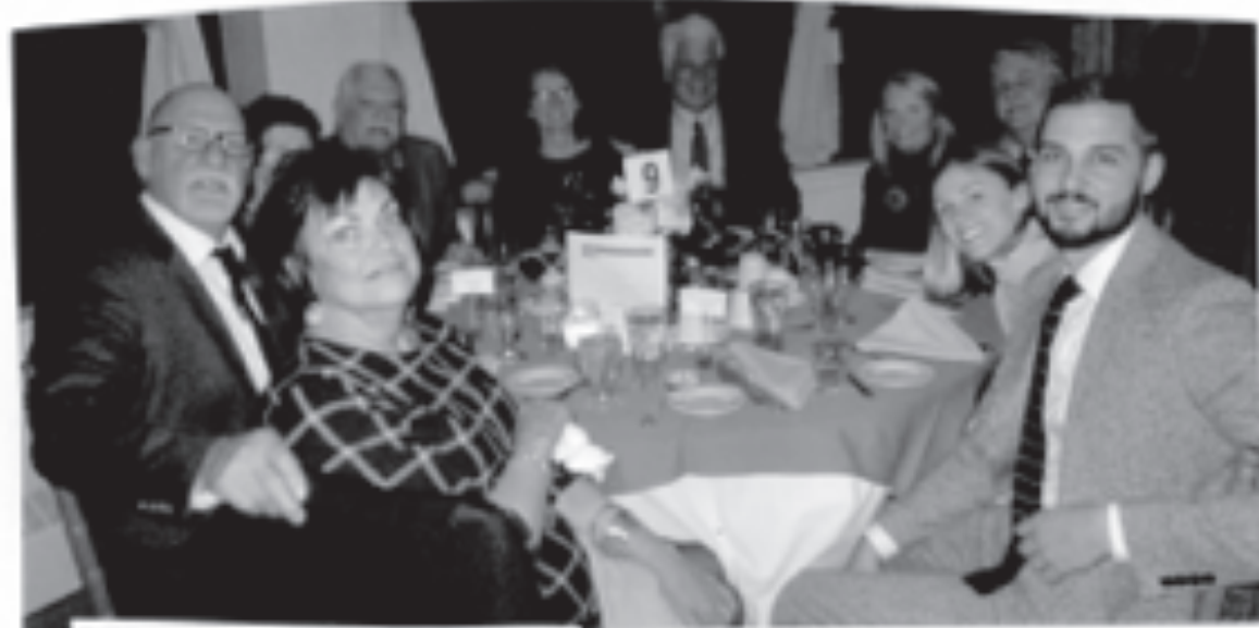
SUPPORTERS OF THE LITTLE ANGEL FUND